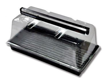
T5HO or LED Strip Light