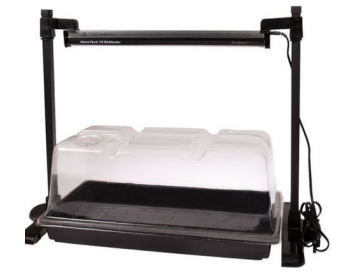
Available seperately or in a Kit

Please visit us online for additional support.